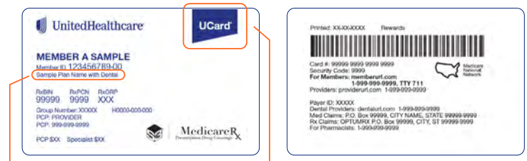
Plan offering dental coverage